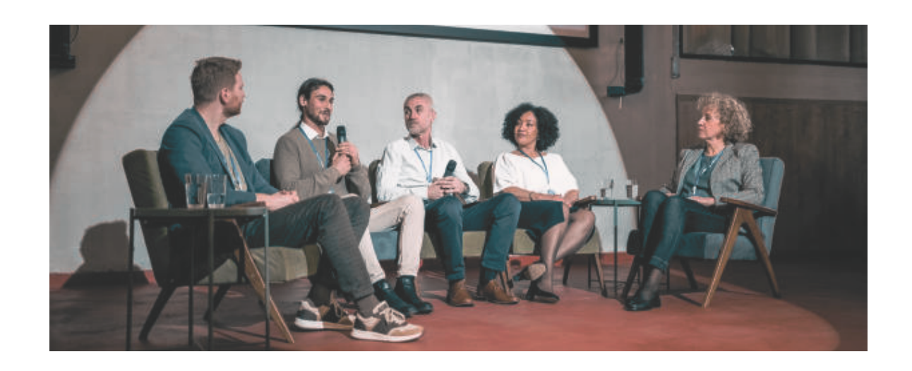
Table to Table is thrilled to announce our first annual conference, Partners in Good Health , in May 2024! The inaugural conference, hosted by Felician University on their Lodi campus, will bring together our agency partners to explore the critical connection between food and health , and to learn together about best practices in supporting better health for our neighbors through access to nutritious food and other resources.

We anticipate an audience of 200-250 agency partner representatives: leaders, program directors, and other staff members, board and volunteers from regional nonprofits, including food pantries, community kitchens, shelters, and group homes throughout Bergen, Essex, Passaic, and Hudson counties.